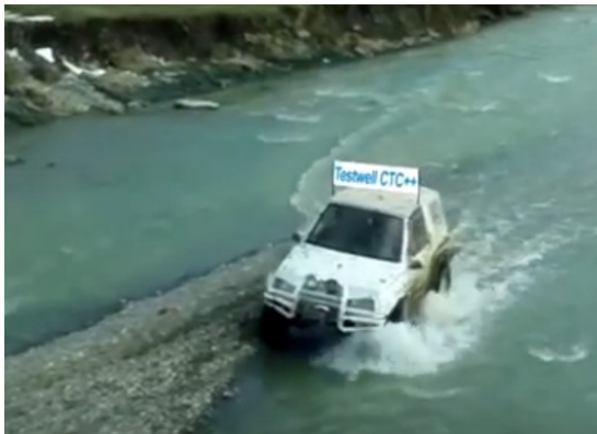
Figure 2 : Testwell CTC++ Test Coverage Analyser is often compared to an off-road vehicle: the tool always works reliably - even in difficult "terrain"...

Some coverage tools get problems when analyzing language constructs that deviate from common standards or have a high nesting depth. However, a good tool for measuring test coverage should also be able to cope with a "creative" programming style.